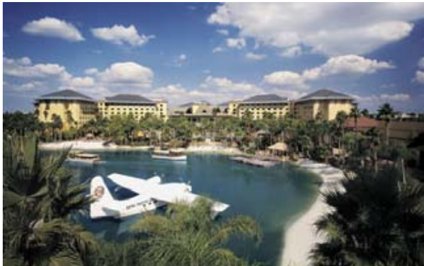
Universal Orlando. Loews Royal Pacific Resort at Universal Orlando may be getting a next door neighbor if Universal goes forward with potential hotel plans.

Looks like Universal Orlando Resort's appetite to invest hasn't been satiated yet, as the theme park company may be looking to add 2,200 more hotel rooms to the property.