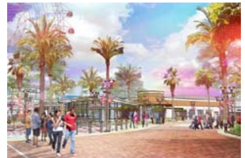
I-Drive 360 is under construction and will open sometime in early 2015.