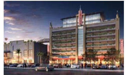
Mango's parking garage. Developer Wallack Holdings LLC has added a new feature atop its $20 million, seven-story public parking garage on International Drive — a glass-enclosed eatery space.

http://www.bizjournals.com/orlando/blog/2014/06/walgreens-sells-i-drive-store-to-make-way-for-new.html?s=print