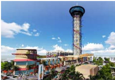
The Skyscraper at Skyplex is a $200 million retail and entertainment destination slated for International Drive. (Wallack Holdings LLC)

is expected to create more than 500 jobs, said Joshua Wallack, COO of Mango's Tropical Cafe, which is developing the project.