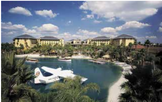
Universal Orlando. Loews Royal Pacific Resort at Universal Orlando may be getting a next door neighbor if Universal goes forward with potential hotel plans.

Looks like Universal Orlando Resort's appetite to invest hasn't been satiated yet, as the theme park company may be looking to add 2,200 more hotel rooms to the property.