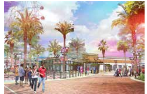
I-Drive 360 is under construction and will open sometime in early 2015.