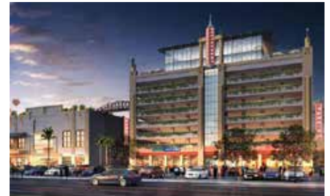
Mango's parking garage. Developer Wallack Holdings LLC has added a new feature atop its $20 million, seven-story public parking garage on International Drive — a glass-enclosed eatery space.

http://www.bizjournals.com/orlando/blog/2014/06/walgreens-sells-i-drive-store-to-make-way-for-new.html?s=print