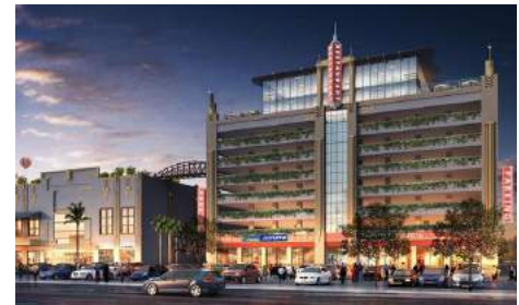
(Osman Baig) Mango's parking garage. Developer Wallack Holdings LLC has added a new feature atop its $20 million, seven-story public parking garage on International Drive — a glass-enclosed eatery space.

Miami Beachbased Wallack Parking LLC and Salt Lake City, Utah-based 8050 I Drive Realty LLC spent $5.3 million to buy the 1.6-acre site that houses a 17,645-squarefoot Walgreens store at 8050 International Drive. The sale-leaseback agreement means