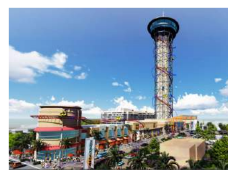
The Skyscraper at Skyplex is a $200 million retail and entertainment destination slated for International Drive. (Wallack Holdings LLC)

The new $200 million, 495,000-square-foot Skyplex will be quite the destination for Orlando's 59 million annual visitors, but it will also be a huge job creator.