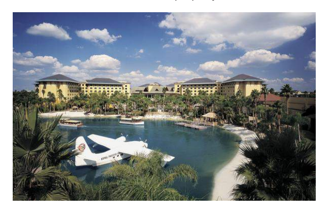
Universal Orlando. Loews Royal Pacific Resort at Universal Orlando may be getting a next door neighbor if Universal goes forward with potential hotel plans.

Looks like Universal Orlando Resort's appetite to invest hasn't been satiated yet, as the theme park company may be looking to add 2,200 more hotel rooms to the property.