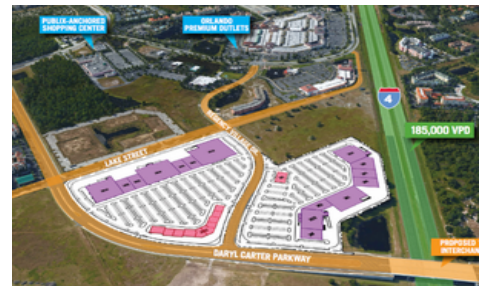
Vineland Pointe is a new 530,000-square-foot shopping plaza planned by O'Connor Capital Partners.

Check OrlandoBusinessJournal.com for more on what's to come for this major project.