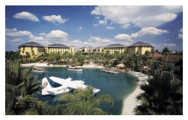
Universal Orlando. Loews Royal Pacific Resort at Universal Orlando may be getting a next door neighbor if Universal goes forward with potential hotel plans.

Looks like Universal Orlando Resort's appetite to invest hasn't been satiated yet, as the theme park company may be looking to add 2,200 more hotel rooms to the property.