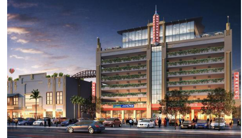
(Osman Baig) Mango's parking garage . Developer Wallack Holdings LLC has added a new feature atop its $20 million, seven-story public parking garage on International Drive — a glass-enclosed eatery space.

Miami Beachbased Wallack Parking LLC and Salt Lake City, Utah-based 8050 I Drive Realty LLC spent $5.3 million to buy the 1.6-acre site that houses a 17,645-squarefoot Walgreens store at 8050 International Drive. The sale-leaseback agreement means