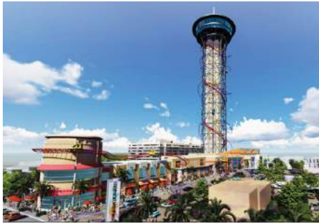
The Skyscraper at Skyplex is a $200 million retail and entertainment destination slated for International Drive.

The new $200 million, 495,000-square-foot Skyplex will be quite the destination for Orlando's 59 million annual visitors, but it will also be a huge job creator.