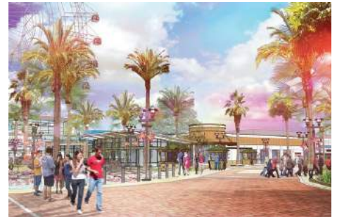
I-Drive 360 is under construction and will open sometime in early 2015.