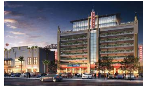
Mango's parking garage. Developer Wallack Holdings LLC has added a new feature atop its $20 million, seven-story public parking garage on International Drive — a glass-enclosed eatery space.

A Walgreens store on International Drive that's slated to become a $20 million public parking garage has sold to an entity related to the owner of the nearby Mango's Tropical Café restaurant and nightclub.