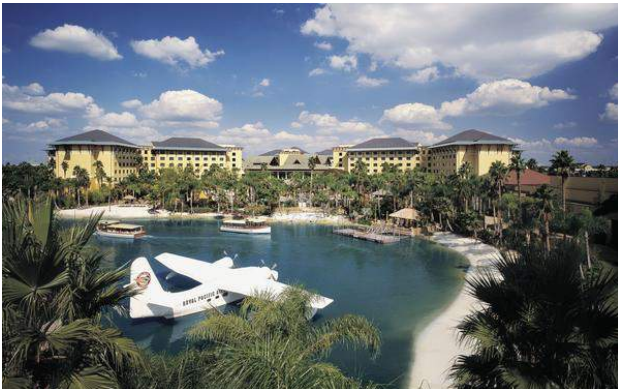
Universal Orlando. Loews Royal Pacific Resort at Universal Orlando may be getting a next door neighbor if Universal goes forward with potential hotel plans.

Looks like Universal Orlando Resort's appetite to invest hasn't been satiated yet, as the theme park company may be looking to add 2,200 more hotel rooms to the property.