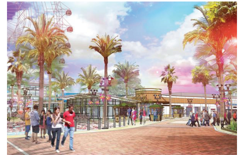
I-Drive 360 is under construction and will open sometime in early 2015.