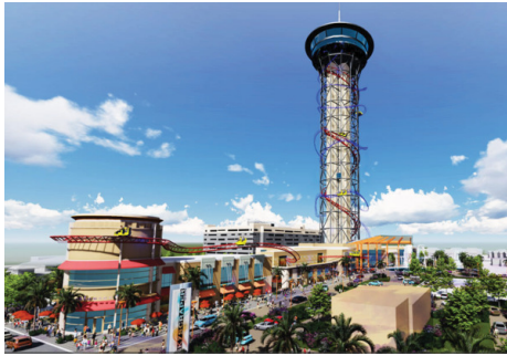
The Skyscraper at Skyplex is a $200 million retail and entertainment destination slated for International Drive.

The new $200 million, 495,000-square-foot Skyplex will be quite the destination for Orlando's 59 million annual visitors, but it will also be a huge job creator.