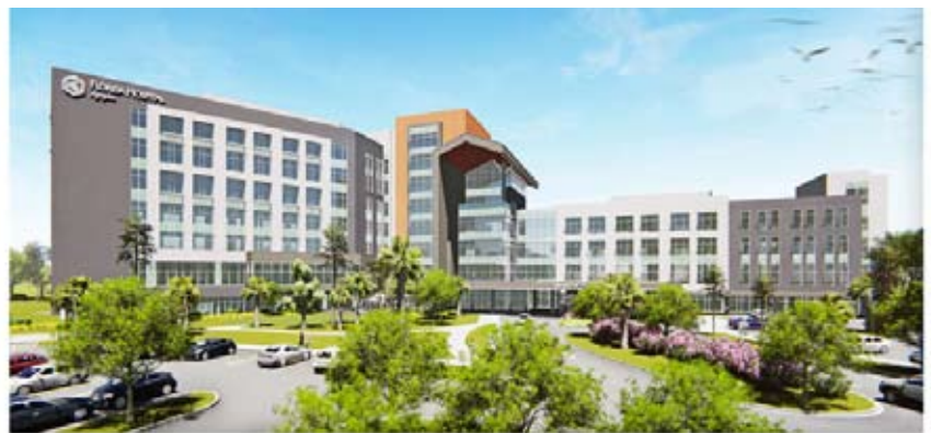
FLORIDA HOSPITAL APOPKA - REPLACEMENT CAMPUS HOSPITAL, FLORIDA | 688 SOUTH US HWY 17 | APOPKA, FL 32712

— Commercial Real Estate Investments | Management | Brokerage | Development | Land