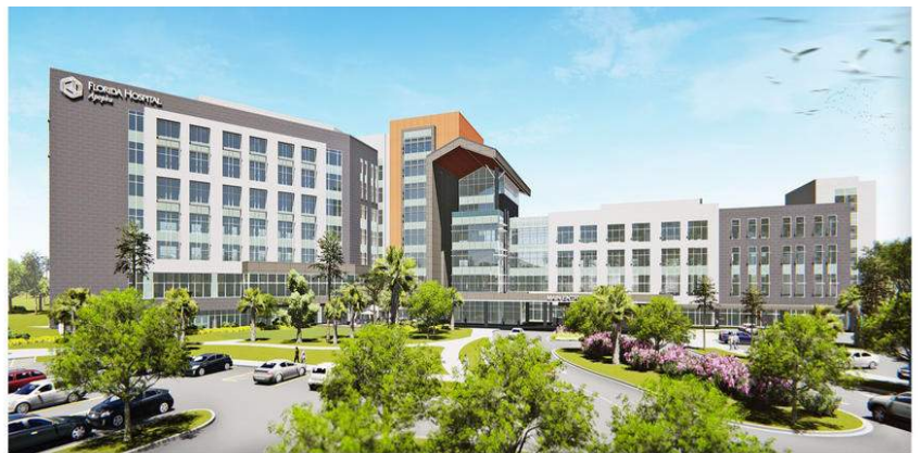
MAIN ENTRY EXTERIOR CONCEPT RENDERING