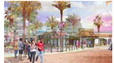
I-Drive 360 is under construction and will open sometime in early 2015.

There have been no details on the project's time line, but previous interviews with U.S. Thrill Rides' Bill Kitchen, one of the minds behind the Polercoaster, said it could be done within two years. In addition, Kitchen told Orlando Business Journal the ride could accommodate up to 1,600 people per hour or up to 13 million people a year.