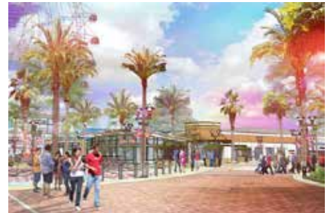
I-Drive 360 is under construction and will open sometime in early 2015.