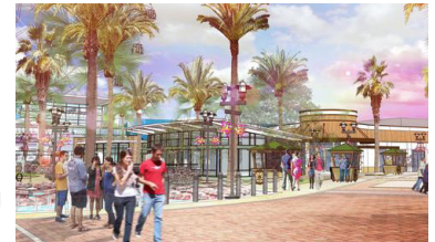
(Merlin Entertainments Group PLC) I-Drive 360 is under construction and will open sometime in early 2015.

There have been no details on the project's time line, but previous interviews with U.S. Thrill Rides' Bill Kitchen, one of the minds behind the Polercoaster, said it could be done within two years. In addition, Kitchen told Orlando Business Journal the ride could accommodate up to 1,600 people per hour or up to 13 million people a year.