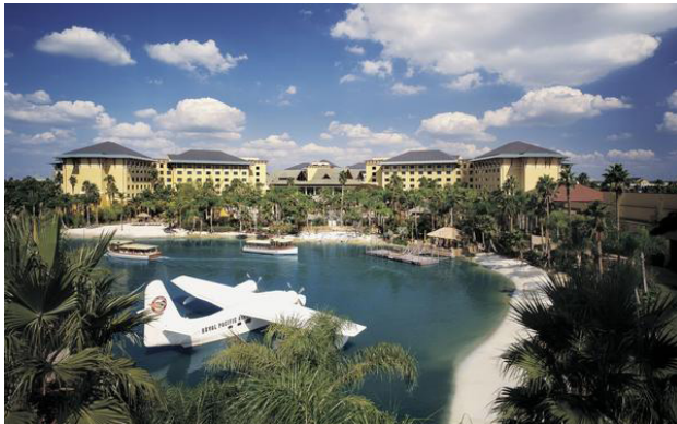
Universal Orlando. Loews Royal Pacific Resort at Universal Orlando may be getting a next door neighbor if Universal goes forward with potential hotel plans.

Looks like Universal Orlando Resort's appetite to invest hasn't been satiated yet, as the theme park company may be looking to add 2,200 more hotel rooms to the property.