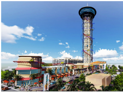
The Skyscraper at Skyplex is a $200 million retail and entertainment destination slated for International Drive.

The new $200 million, 495,000-square-foot Skyplex will be quite the destination for Orlando's 59 million annual visitors, but it will also be a huge job creator.