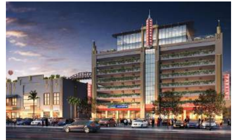
Mango's parking garage. Developer Wallack Holdings LLC has added a new feature atop its $20 million, seven-story public parking garage on International Drive — a glass-enclosed eatery space.

A Walgreens store on International Drive that's slated to become a $20 million public parking garage has sold to an entity related to the owner of the nearby Mango's Tropical Café restaurant and nightclub.