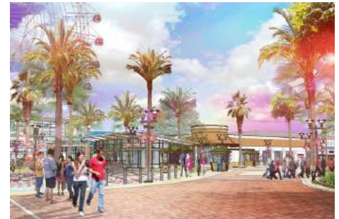
I-Drive 360 is under construction and will open sometime in early 2015.