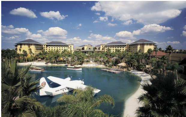
Universal Orlando. Loews Royal Pacific Resort at Universal Orlando may be getting a next door neighbor if Universal goes forward with potential hotel plans.

Looks like Universal Orlando Resort's appetite to invest hasn't been satiated yet, as the theme park company may be looking to add 2,200 more hotel rooms to the property.