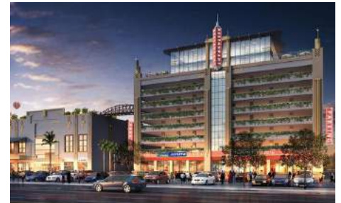
Mango's parking garage. Developer Wallack Holdings LLC has added a new feature atop its $20 million, seven-story public parking garage on International Drive — a glass-enclosed eatery space.

http://www.bizjournals.com/orlando/blog/2014/06/walgreens-sells-i-drive-store-to-make-way-for-new.html?s=print