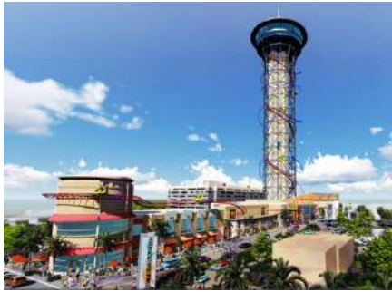
The Skyscraper at Skyplex is a $200 million retail and entertainment destination slated for International Drive. (Wallack Holdings LLC)

The new $200 million, 495,000-square-foot Skyplex will be quite the destination for Orlando's 59 million annual visitors, but it will also be a huge job creator.