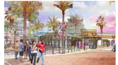
I-Drive 360 is under construction and will open sometime in early 2015.

There have been no details on the project's time line, but previous interviews with U.S. Thrill Rides' Bill Kitchen, one of the minds behind the Polercoaster, said it could be done within two years. In addition, Kitchen told Orlando Business Journal the ride could accommodate up to 1,600 people per hour or up to 13 million people a year.