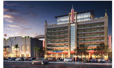
Mango's parking garage. Developer Wallack Holdings LLC has added a new feature atop its $20 million, seven-story public parking garage on International Drive — a glass-enclosed eatery space.

http://www.bizjournals.com/orlando/blog/2014/06/walgreens-sells-i-drive-store-to-make-way-for-new.html?s=print