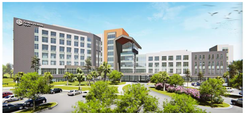
MAIN ENTRY EXTERIOR CONCEPT RENDERING