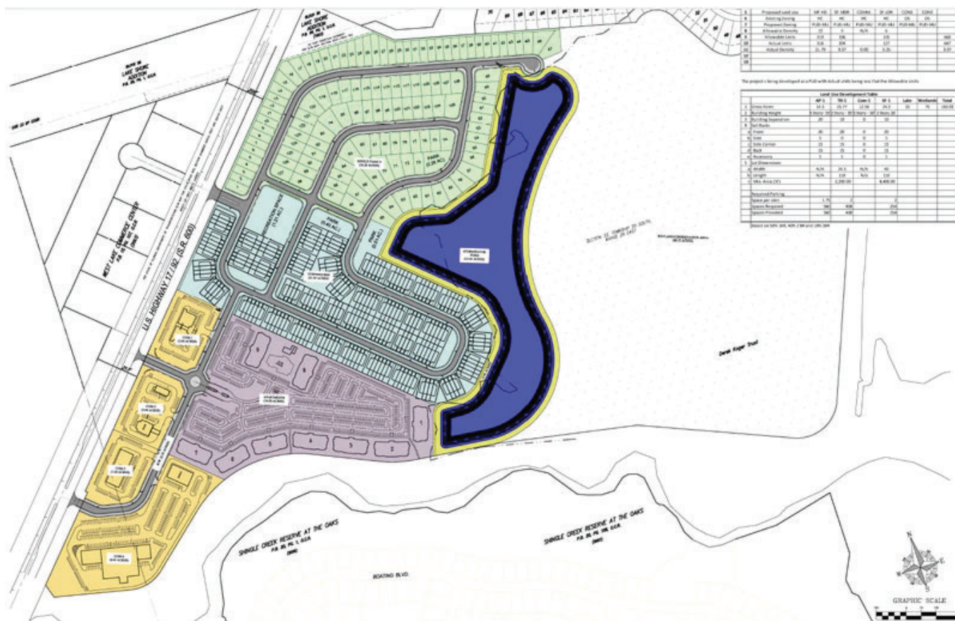
Osceola Village Center on John Young Parkway will have a mix of retail uses (yellow), apartments (pink), townhomes (blue) and single family homes (green).