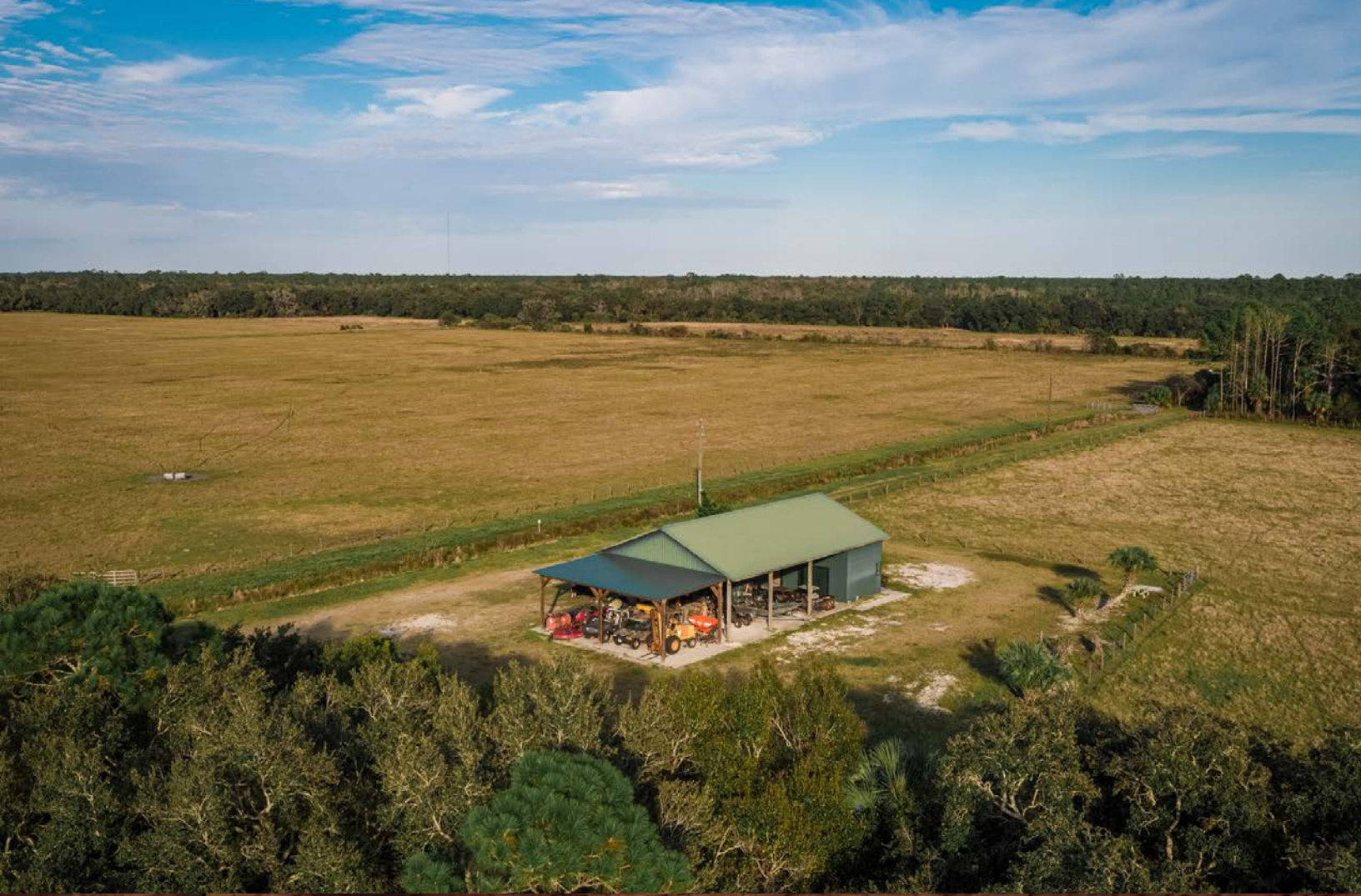
Recreation and Working Spaces