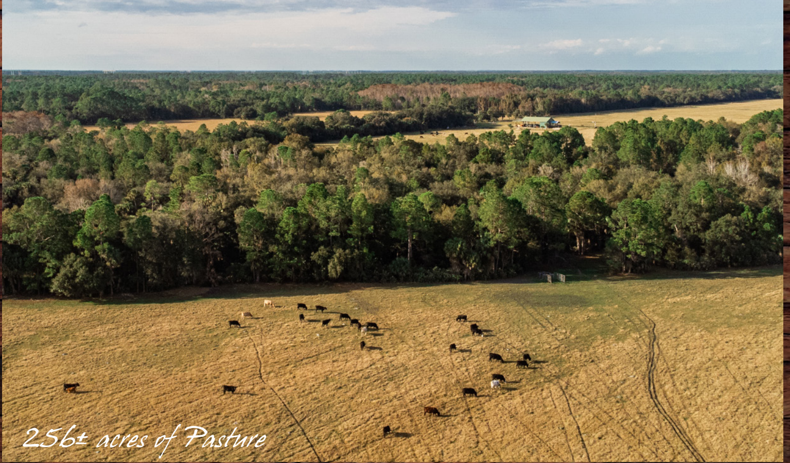
256± acres of Pasture