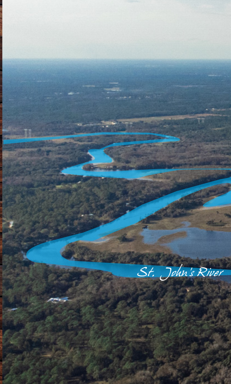
St. John's River

What's better than one major waterway located on an elite property? Having two! Deep Creek directly borders and flows south to the river on the northeastern portion of this property (see map). Deep Creek connects to the St. Johns River. Small boats can be used to enjoy Deep Creek and all it has to offer. Deep Creek is a beautiful additional waterway that gives River Bend Ranch Reserve another 1.3 miles of waterway frontage (see photos).