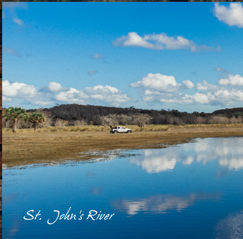
St. John's River