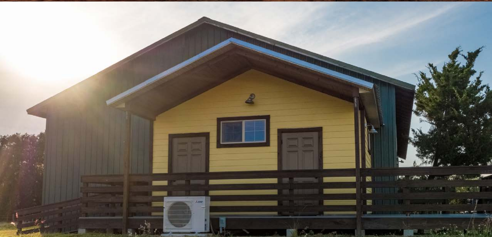
Bathrooms & Showers