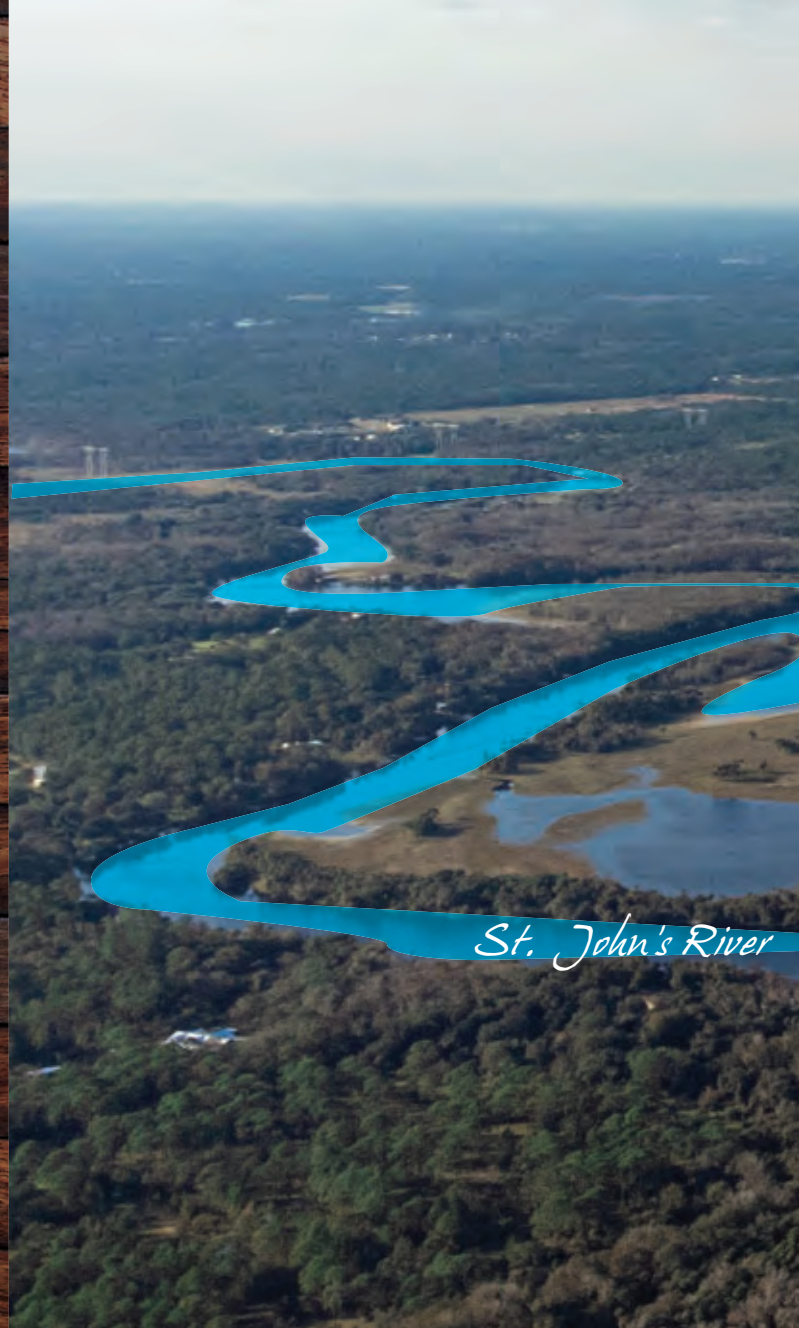
St. John's River

What's better than one major waterway located on an elite property? Having two! Deep Creek directly borders and flows south to the river on the northeastern portion of this property (see map). Deep Creek connects to the St. Johns River. Small boats can be used to enjoy Deep Creek and all it has to offer. Deep Creek is a beautiful additional waterway that gives River Bend Ranch Reserve another 1.3 miles of waterway frontage (see photos).