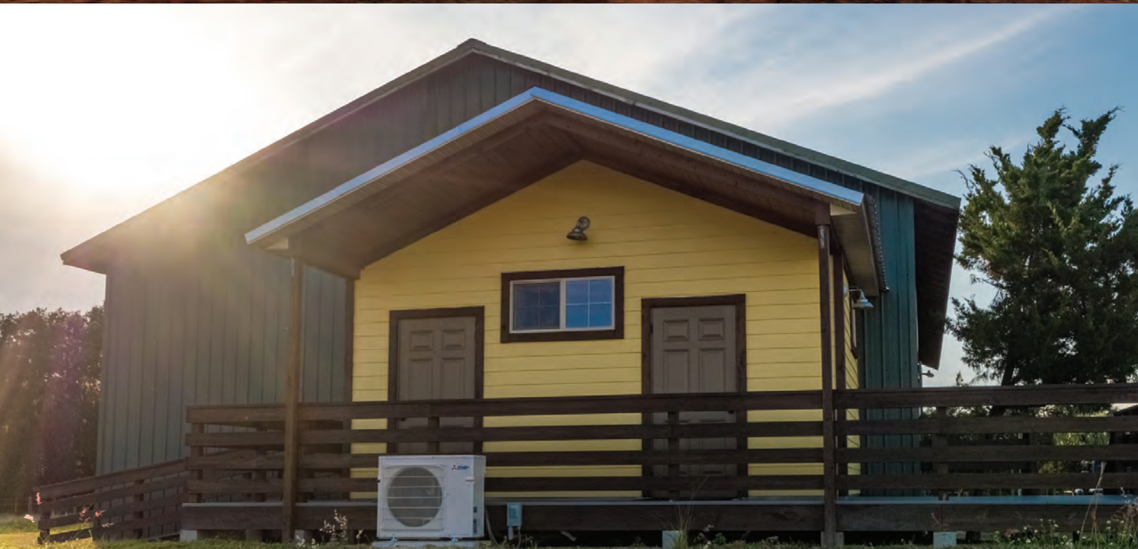
Bathrooms & Showers