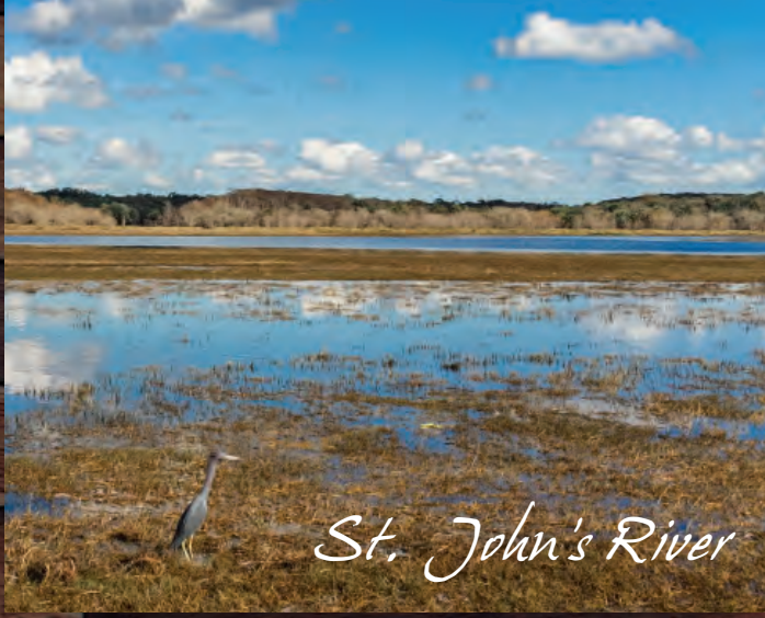
St. John's River