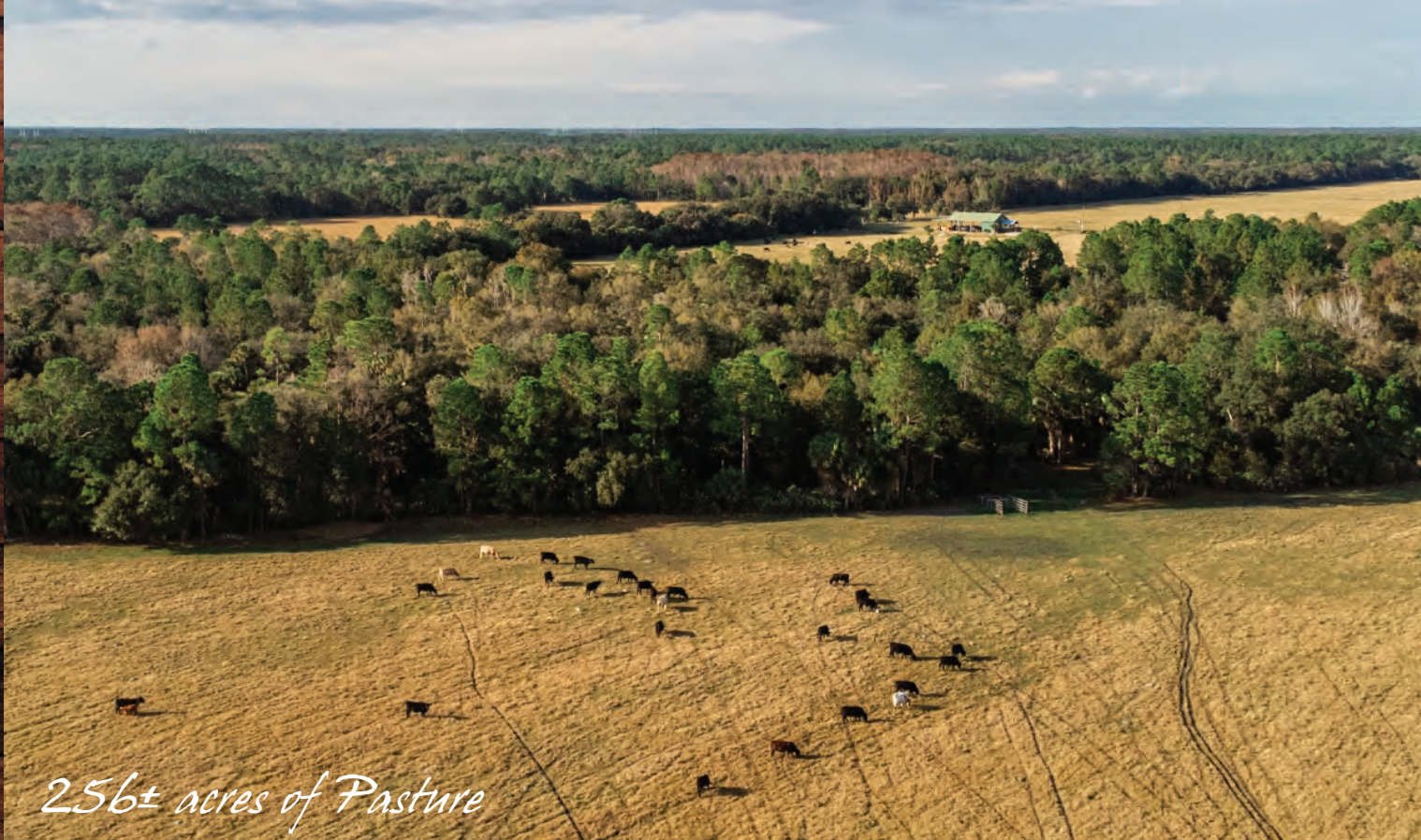
256± acres of Pasture