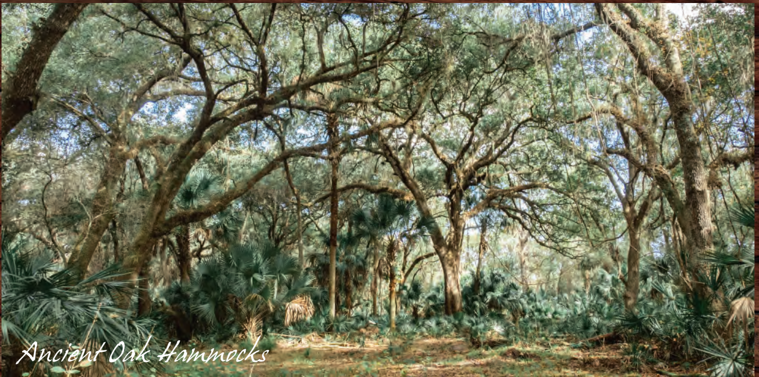
Ancient Oak Hammocks