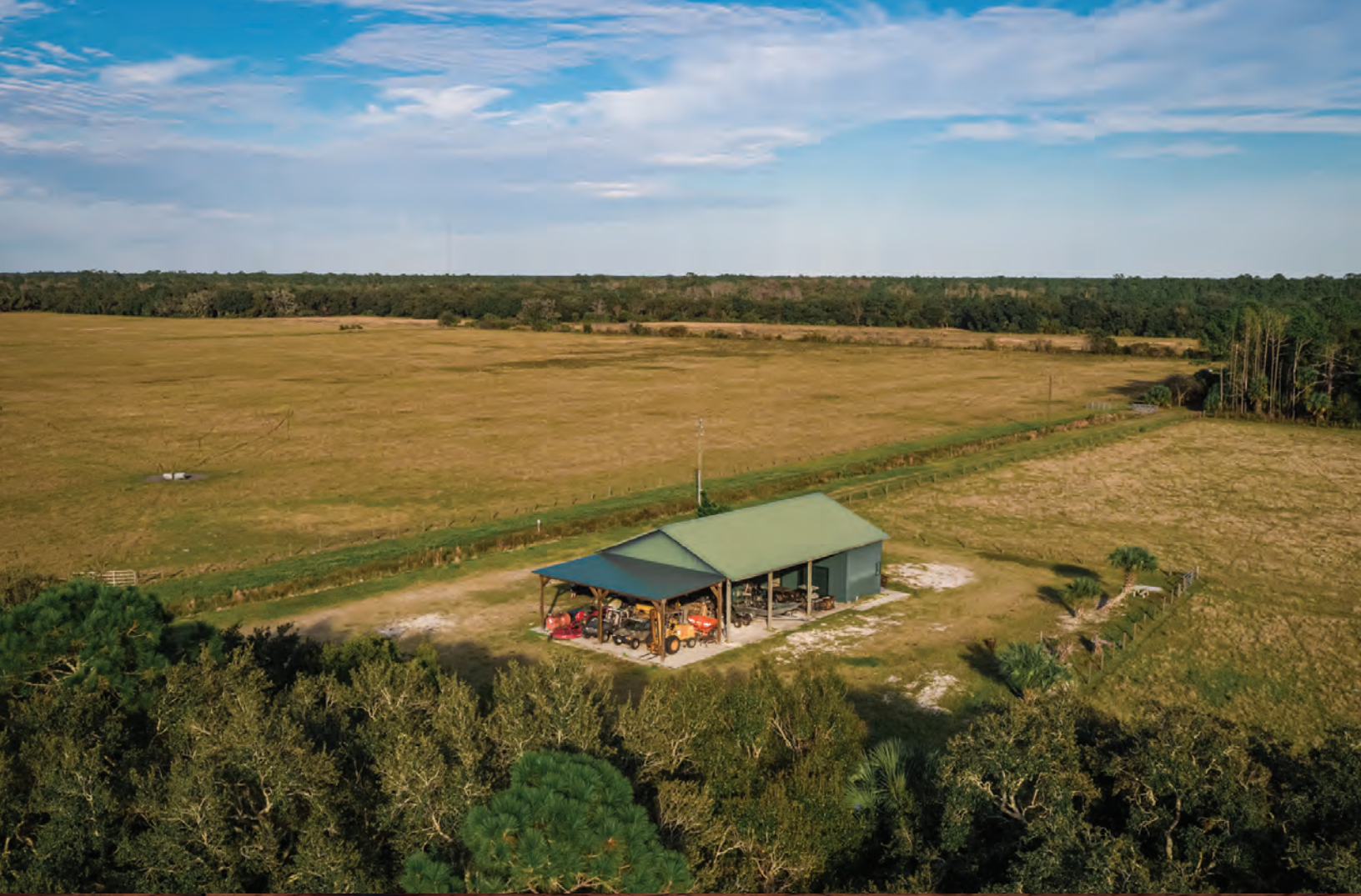
Recreation and Working Spaces