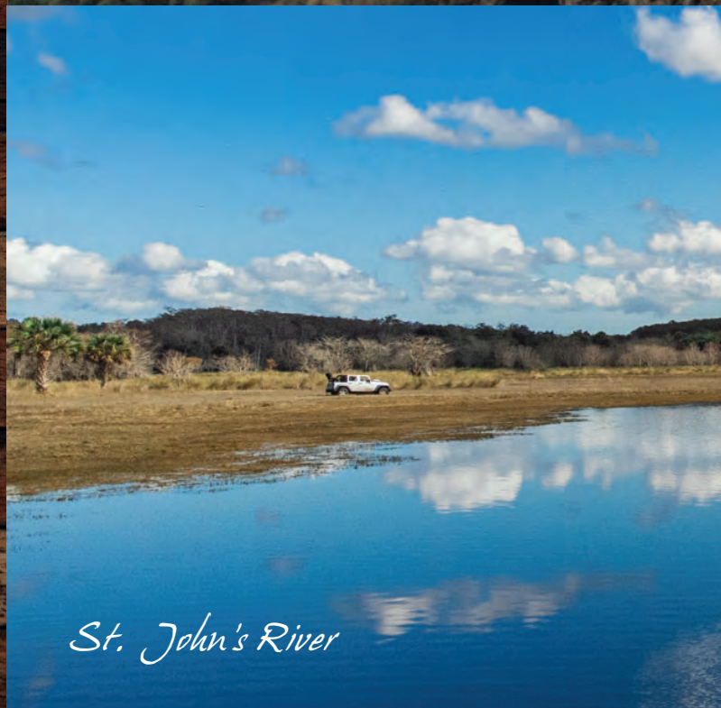
St. John's River