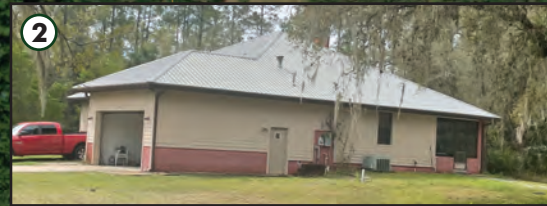
2 single-family homes on property