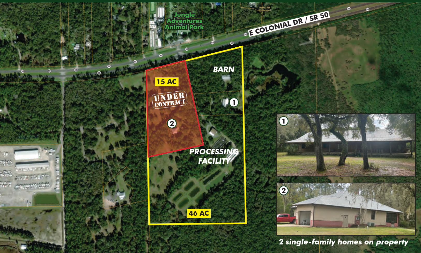
2 single-family homes on property